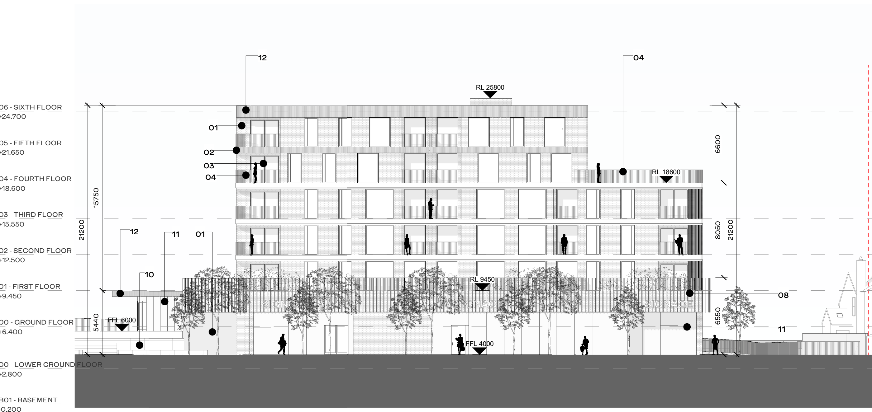
2 BLOCK D - SOUTH ELEVATION 1:200